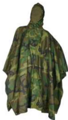
PONCHO WET WEATHER

WATER REPELLENT, PRINTED CAMOUFLAGE-WOVEN RIPSTOP PATTERN OUTSIDE, PLASTIC, POLYURETHANE OUTSIDE