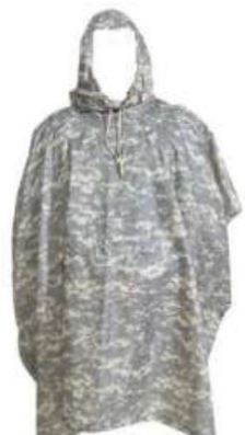
PONCHO WET WEATHER

WATER REPELLENT, PRINTED CAMOUFLAGE-WOVEN RIPSTOP PATTERN OUTSIDE, PLASTIC, POLYURETHANE OUTSIDE