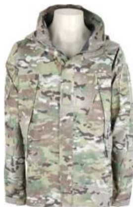
EXTREME WET/COLD WEATHER JACKET LEVEL VI LAYER 6 JACKET ECWCS GEN III, EXTREME COLD/WEATHER, MULTI-CAM