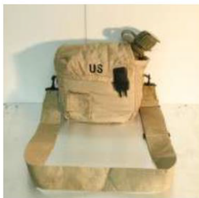
COVER, WATER CANTEEN 2Q TAN DUCK, NYLON, TAN, W/SLIDE KEEPERS