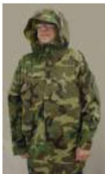
PARKA WET WEATHER IMPROVED WOODLAND CAMOUFLAGE UNIVERSAL CAMOUFLAGE