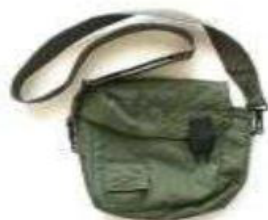
COVER CANTEEN 2QT DUCK, NYLON, GREEN, W/SLIDE KEEPERS